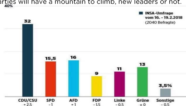
Chart of the Week